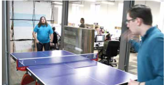
Ping pong battles provide a welcome work respite.

“But most disruptive technology comes from somebody that doesn’t have real roots in an industry. They have enough knowledge that they want to solve a problem. Had we known the complexities five years ago, we may not have traveled down this road. But