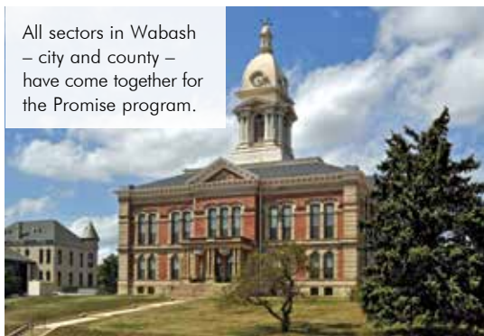
All sectors in Wabash – city and county – have come together for the Promise program.

Good times and lasting memories from both cities. Great programs and exciting progress for both communities today.