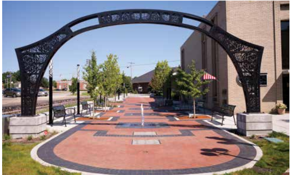
The Short Street Plaza provides a pedestrian-friendly downtown venue in North Vernon.

the state can look at the federal government and say, ‘Yes, we have been good stewards of your dollars.’ And the state can look at us and say, ‘Yes, you’ve been good stewards of our dollars.’ ”