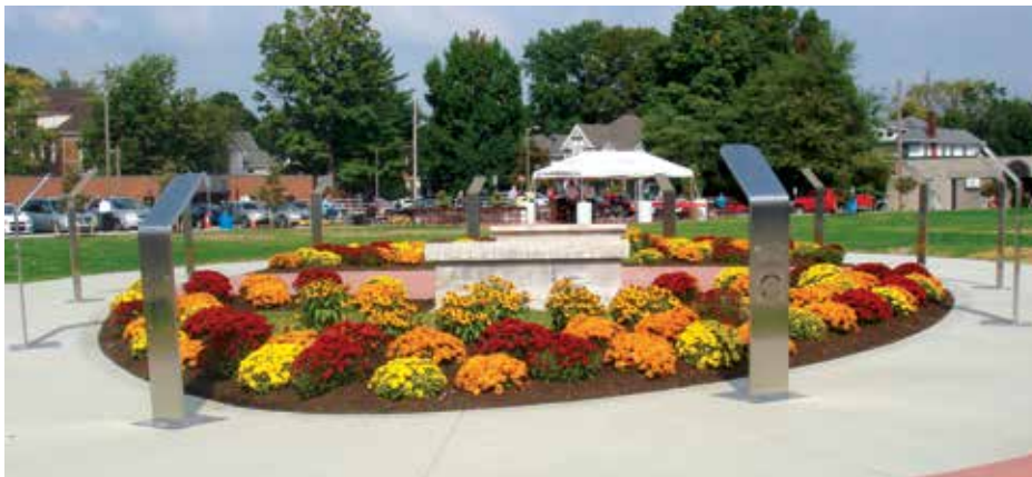
Princeton has a new community gathering point in its Bicentennial Plaza.

"It takes so long to start getting results,"