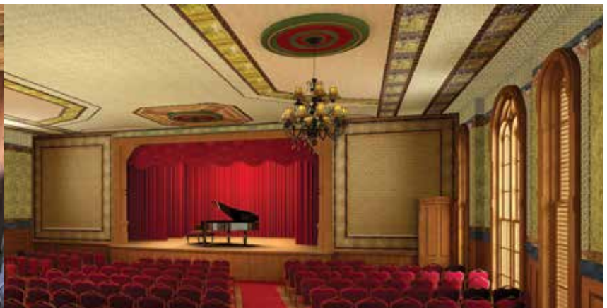
A transformation is taking place at the Delphi Opera House.