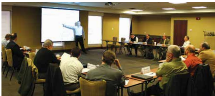
Task force members receive an update on the water resources study at the April meeting.