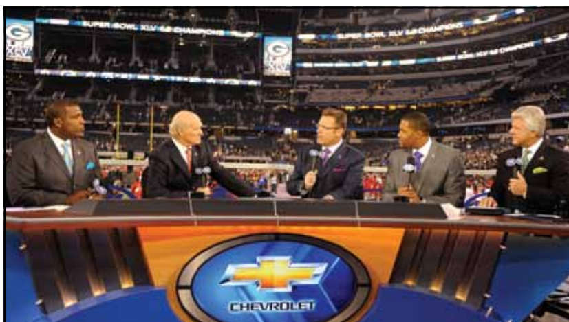
The cast of Fox NFL Sunday at last year’s Super Bowl: (left to right) host Curt Menefee, Bradshaw, Howie Long, Michael Strahan and Jimmy Johnson.

TB: “The wonderful thing about this business is I have met some of the more colorful personalities. My favorite interviews were always with (the recently retired, yet again) Brett Favre. He was always someone that I really enjoyed sitting down with.